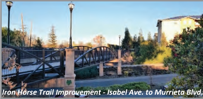
Iron Horse Trail Improvement - Isabel Ave. to Murrieta Blvd.