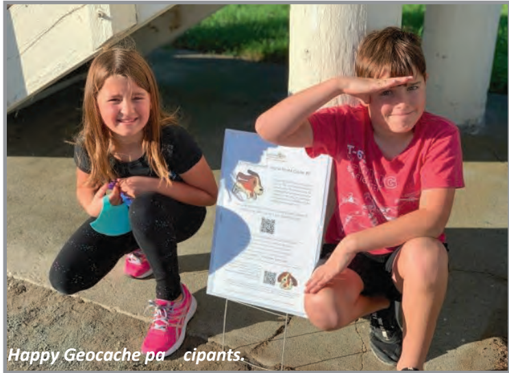
Happy Geocache participants.

Are you interested in going on an adventure throughout Livermore, finding clues, and solving puzzles for a chance to win prizes? Join the over 600 people who have completed the City's Asset Geocache. Participants will be guided around the City of Livermore searching for five hidden caches while learning about community-owned infrastructure, including roads, pipes, traffic signals, and more. It's fun, COVID safe, and engaging for all ages. Learn more about how the City cares for Livermore's infrastructure at www.livermoreassets.net/geocache .