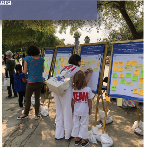
Residents write down their ideas and vision for the future of Livermore