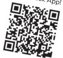
Summer 2023 Theme: "Find Your Voice"