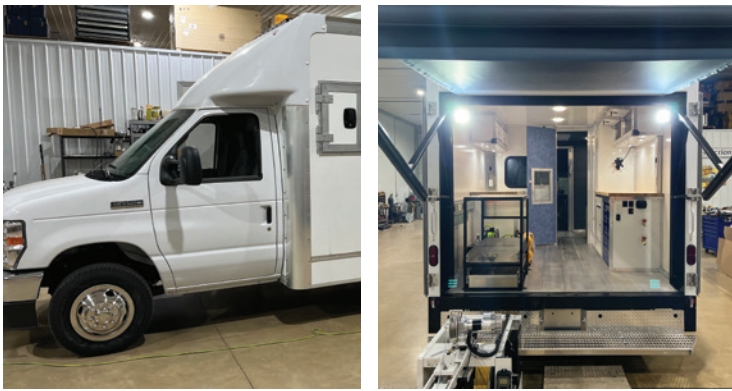
Livermore’s new hybrid CCTV truck

To better serve our community, the City of Livermore recently upgraded its CCTV truck. This new hybrid vehicle is equipped with 360 HD digital video capabilities and software that incorporates geographic information systems (GIS) mapping technology. By performing more inspections and preventative maintenance, the City will continue to provide quality sewer service. After all, an ounce of prevention is worth a pound of cure.