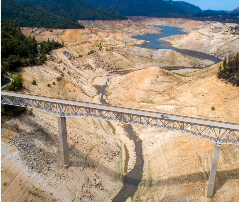
Lake Oroville in March 2023 compared to August 2021. This lake is part of the State Water Project, which typically provides 70% of your drinking water.